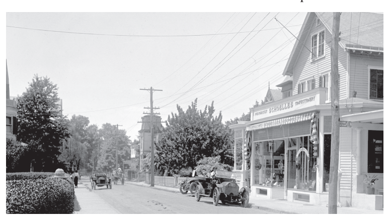
Schoelles Pharmacy on Sea Cliff Avenue, 1914

Visit our website, seacliffmuseum.org to hear our audio tapes from current and past residents.