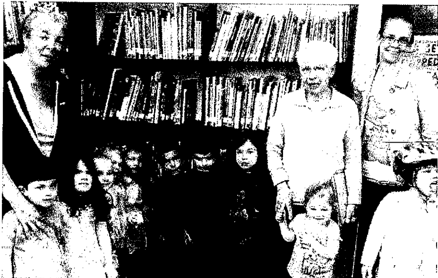
Friday morning frolics at the Children’s Library.