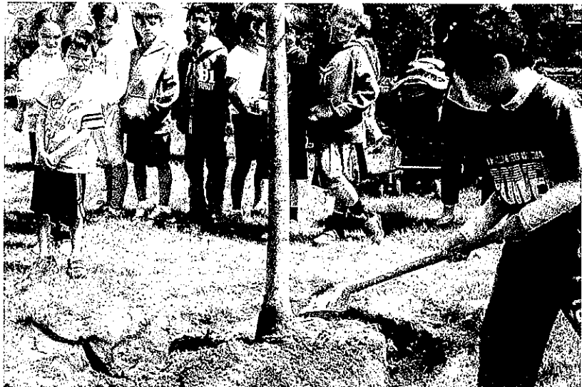
This young fellow helps to plant the tree at Geohegan Park to celebrate Arbor Day.