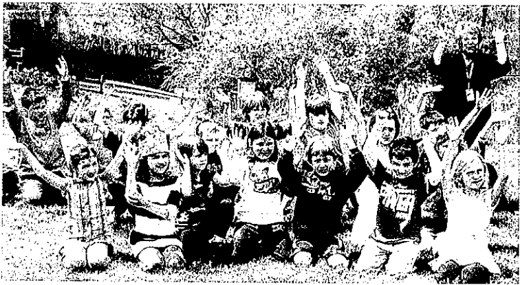
One of Sea Cliff School 2nd grade classes sings a song about trees as part of their Arbor Day celebration