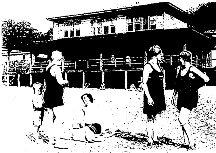
Beachgoers at the original Sea Cliff Beach Pavilion.

In 1965 the "Old Pavilion" burned down in a spectacular fire. Please watch for opening dates for the new exhibit in September.