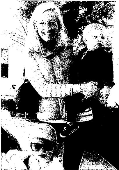
Starting the day off right at the Children's Library!