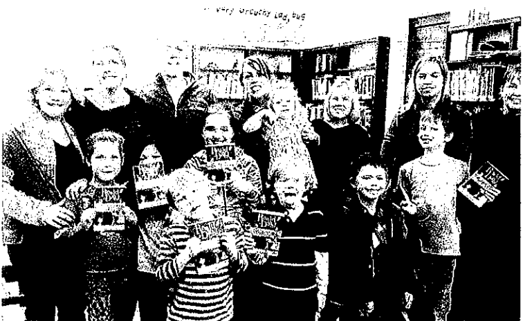
The book was WITCHES by Roald Dahl but none of the families at Family Book Night look very frightened.