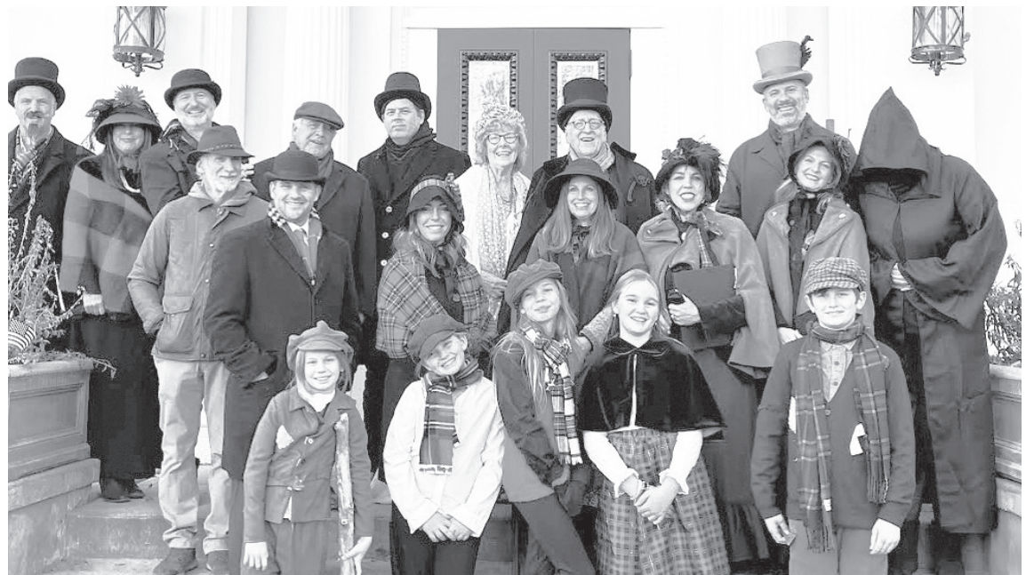
The Sea Cliff Civic Association's Annual Scrooge Stroll will take place Sunday, December 4.

Watch for the return of the Sea Cliff Civic Association's Holiday Duck Hunt on January 2 from 1 to 2 p.m. – 10 ducks in 10 parks! For more information, email the SCCA at sccivicaassociation@gmail.com .