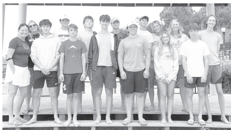
Some of the Sea Cliff Beach staff members from summer 2022, still smiling at the end of the season. Anyone interested in joining for next season, it's not too early to look into your Red Cross training.

If you have suggestions for speakers or topics, please send us a message through our Facebook page. You can search Facebook for Sea Cliff Landmarks Association and Biennial House Tour.