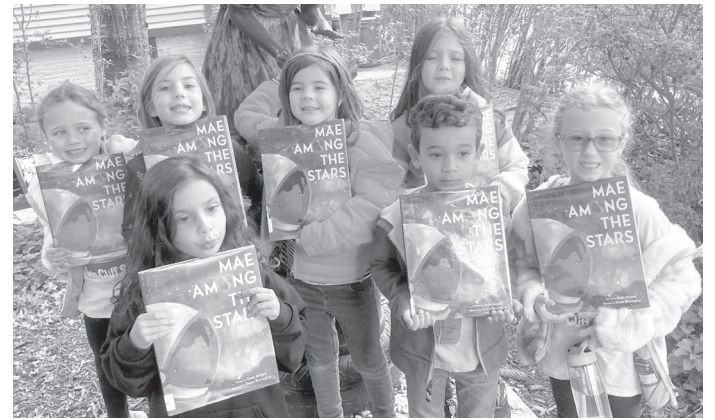
Friends gather to discuss a great book!