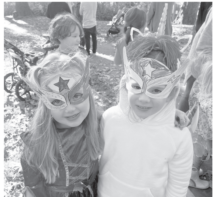
A couple girls show off the superhero and unicorn masks they made at the Civic Association's Cider Social gathering in Central Park in October.