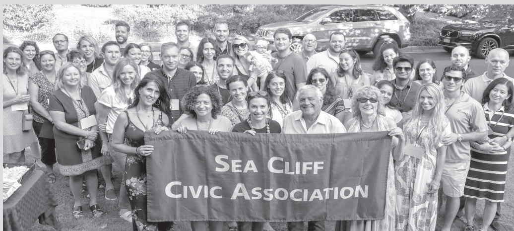
The Newcomers' Welcoming Party 2022.